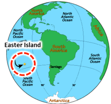
Figure 1 Location of Easter Island on the Globe.

With the loss of their forest, the quality of life for Islanders plummeted. Streams and drinking water supplies dried up. Crop yields declined as wind, rain, and sunlight eroded top soils. Fires became a luxury since no wood could be found on the island, and grasses had to be used for fuel. No longer could rope be manufactured to move the stone statues and they were abandoned. The Easter Islanders began to starve, lacking their access to porpoise meat and having depleted the island of birds. As life worsened, the orderly society disappeared and chaos and disarray prevailed. Survivors formed bands and bitter fighting erupted. By the